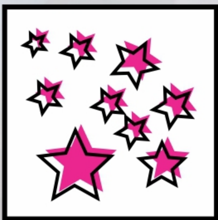
Out of register

To ensure that a rotogravure print of a multi-coloured image is clear and sharp, it is necessary to ensure that each colour is printed in exactly the right location with respect to the previously printed colours. If this is not done, we say the printing is 'out of register', or that there's a registration error. Such prints have a fuzzy or blurred appearance.