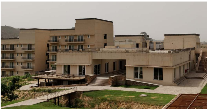
Canteen and housing facility

AAETI is very happy with the performance of the HMX cooling solutions, which not only provide the required level of comfort, but also contribute to substantial energy savings in the institute.