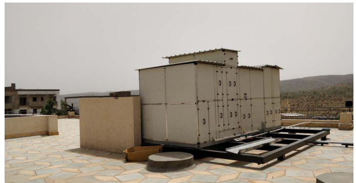
Machine installed at AAETI