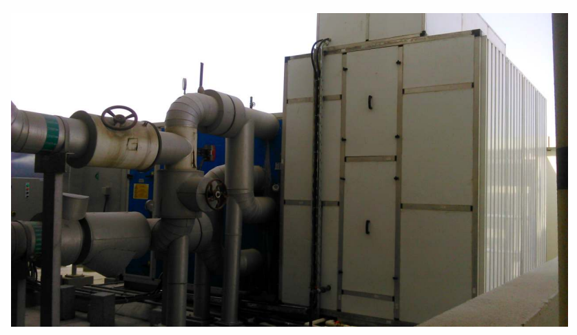
Installation of HMX-PCU at Al Waha towers.

Al Waha tower had two FAHUs installed (capacity: 30,000 CFM each) to treat their 15% make-up fresh air. The FAHU cooled and dehumidified the make-up fresh air from the ambient 50°C to 15°C. The FAHU tonnage consumption for this was 510 TR/Hr. In spite of the fresh air quantity being only 15%, the tonnage consumed was almost 30% of the entire chiller load. This meant less available tonnage for cooling the recirculated air and therefore, inadequate cooling for the fresh air being supplied.