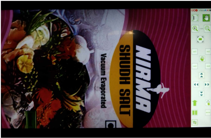
ViewAXIS Mega 2.0 dashboard