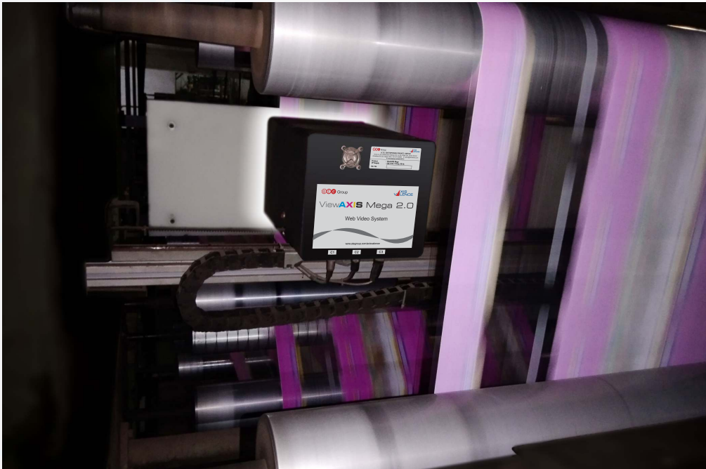
ViewAXIS Mega 2.0 in operation

The split screen function enables the operator to compare the print run with an earlier captured/stored “golden” template. The user-friendly Graphic User Interface (GUI) and auto-scan option further enable the operator to identify and continually scan key print locations on the running web.