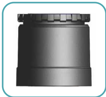
Smart Yarn Catcher open – yarn released

The TeraSpin Smart Yarn Catcher addresses the need of spinners for a user friendly yarn clamping device on every ring frame spindle.