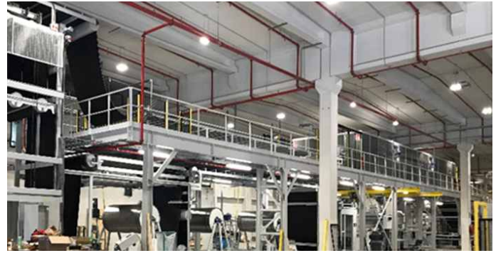
Carpet back coating lines