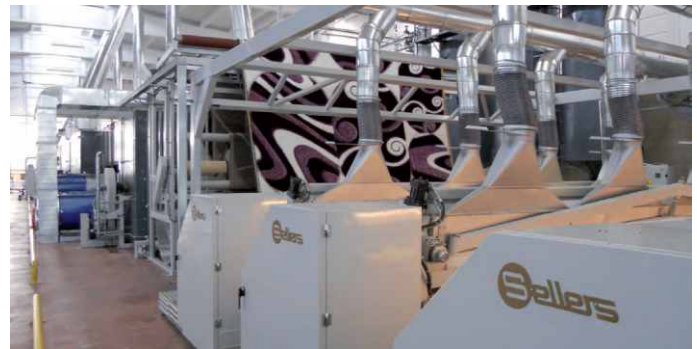
Carpet shearing machines