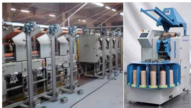
Evilo Contractwinder and Profitwinder

Matthys can also undertake custom-made projects.