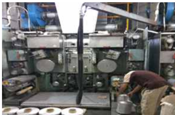
PT Universal Carpet, Indonesia (BCF line upgrade)