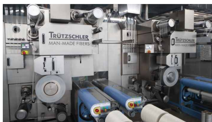
Trützschler new OPTIMA 4-End