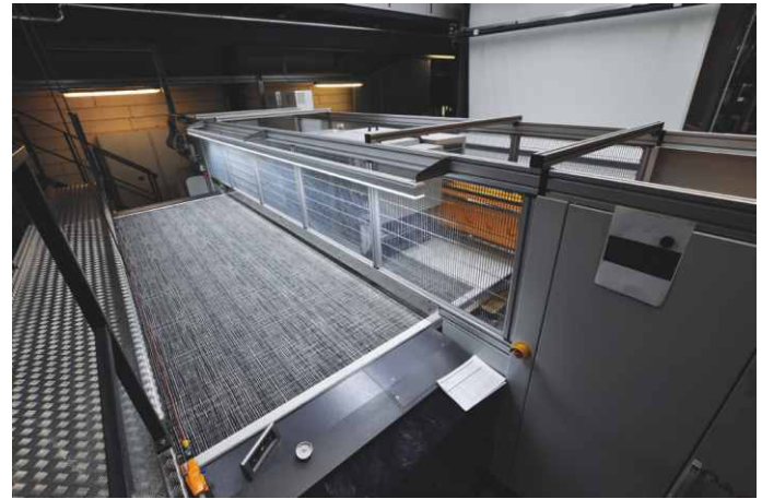
Zimmer Colaris 96-4200