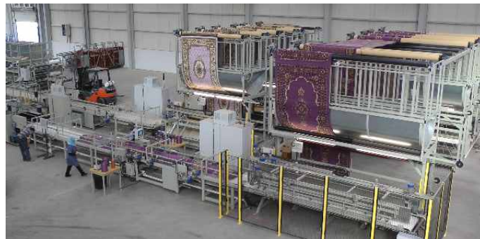
Evilo carpet confection lines

The Matthys product range also includes: