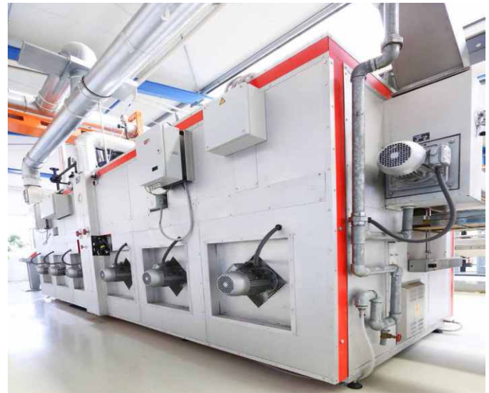
Heat setting machine