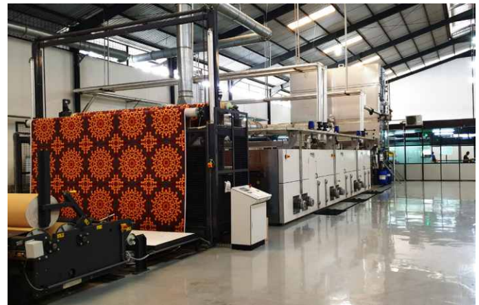
Zimmer Colaris 48-4200