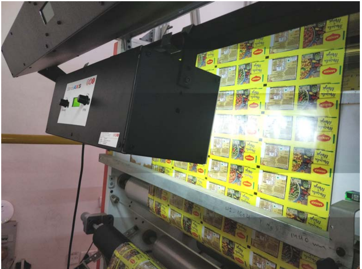
Machine mounted StrobAXIS for full print width monitoring