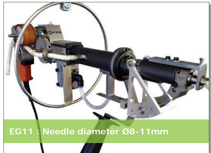
EG11 : Needle diameter Ø8-11mm