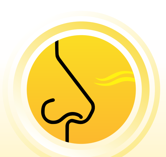
Increase in solvent odour at shop-floor