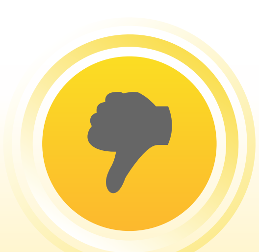
Reduced print quality