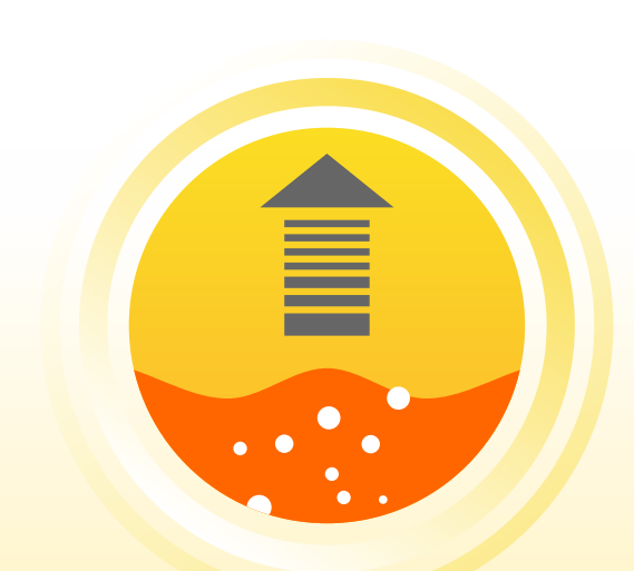
Increased solvent evaporation