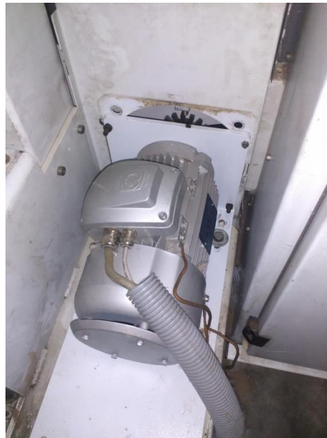
Doffer AC motor (new)