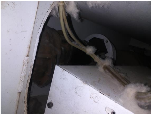
Feed roller DC motor (old)