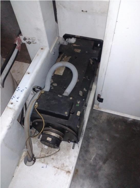
Doffer DC motor (old)