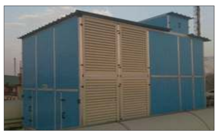
HMX-Ambiator at M&M