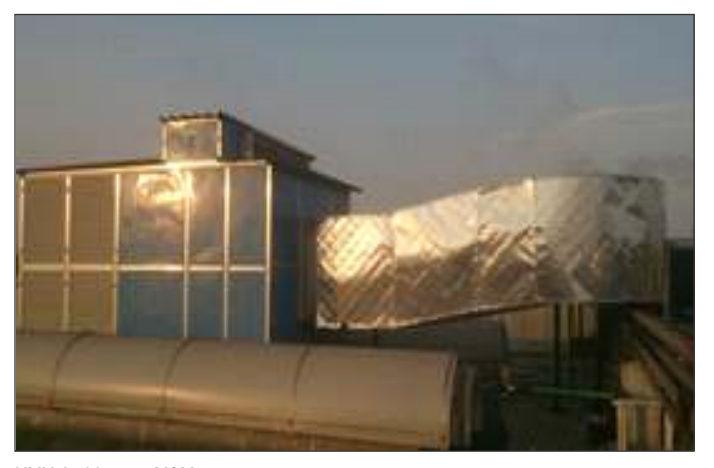
HMX-Ambiator at M&M

The management at M&M now enjoy the dual benefits of excellent cooling and power savings after the commissioning of HMX-Ambiator. They are already in talk with us for replacing 2 x 200 TR chiller units at two different locations in the same factory and also using the HMX-Ambiator to cool another tractor assembly shop floor.