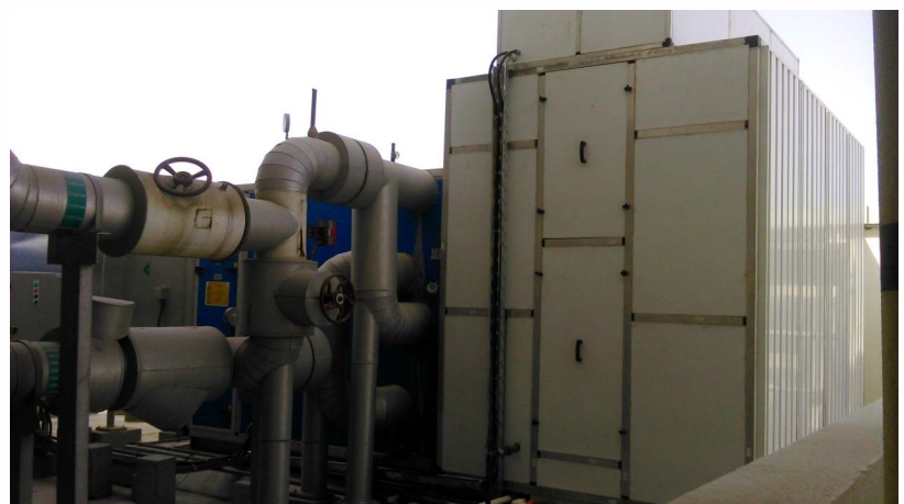
Installation of HMX-PCU at AI Waha towers.

AI Waha tower had two FAHUs installed (capacity: 30,000 CFM each) to treat their 15% make-up fresh air. The FAHU cooled and dehumidified the make-up fresh air from the ambient 50°C to 15°C. The FAHU tonnage consumption for this was 510 TR/Hr. In spite of the fresh air quantity being only 15%, the tonnage consumed was almost 30% of the entire chiller load. This meant less available tonnage for cooling the recirculated air and therefore, inadequate cooling for the fresh air being supplied.